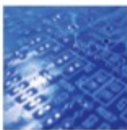
3D Paste AOI