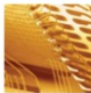
Wire Bond AOI