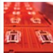
Die and Epoxy AOI