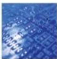
3D Paste AOI