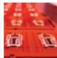
Die and Epoxy AOI