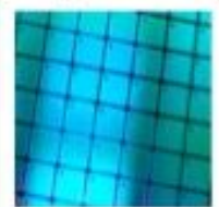
Die Surface AOI